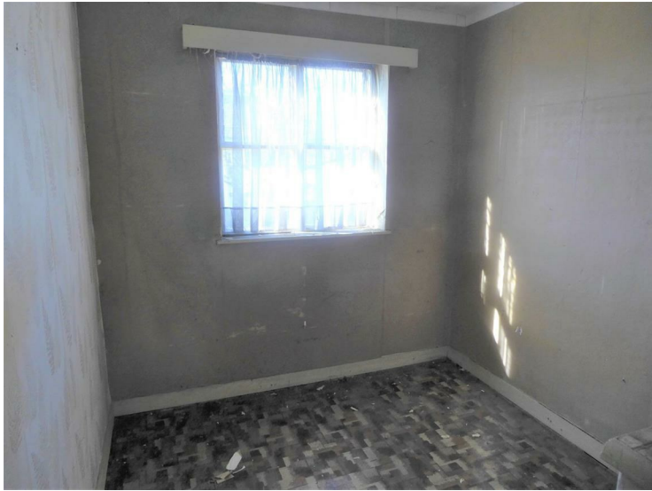
Front aspect window, access to loft space.